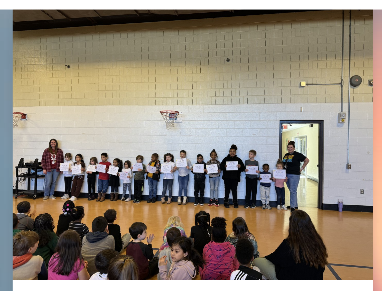
3-5 CALN OWLstanding Students - February